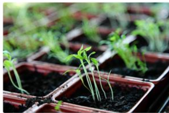
Duluth to Receive Deep-Winter Greenhouse and More