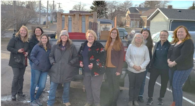
JLD members met before the April GMM for some spring cleaning.